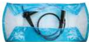
Open it up and place the endoscope inside